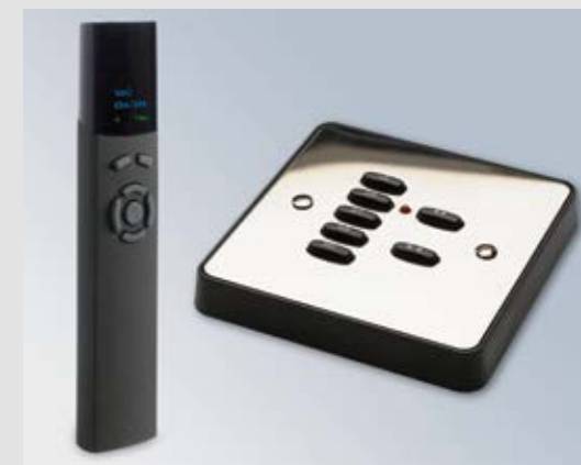
Remote controls Silent Gliss 0450