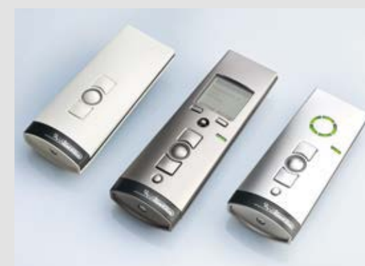
Remote controls Silent Gliss 9940