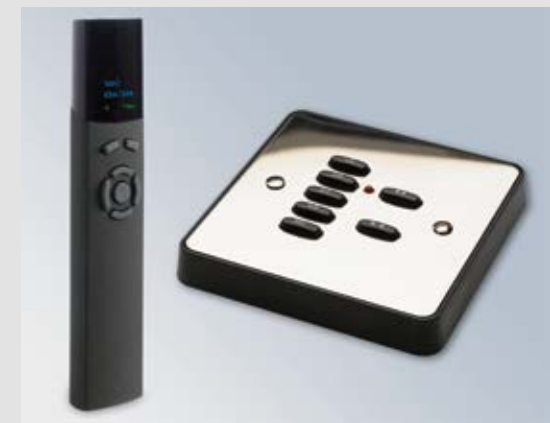
Remote controls Silent Gliss 0450