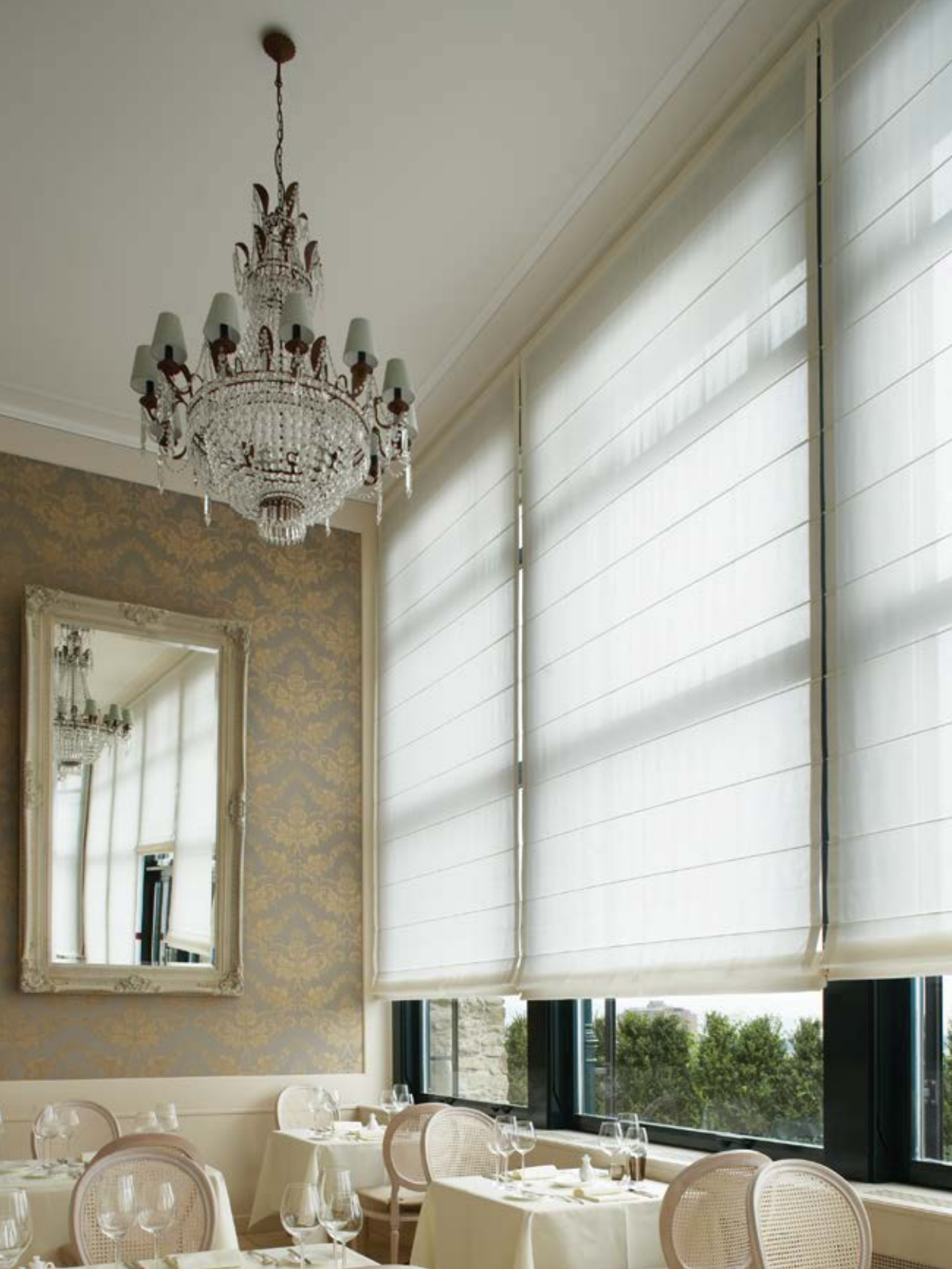
Roman Blind System Silent Gliss 2350