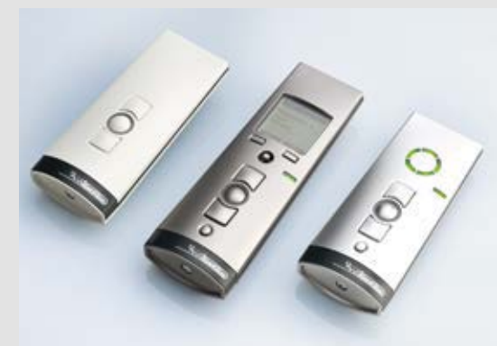
Remote controls Silent Gliss 9940